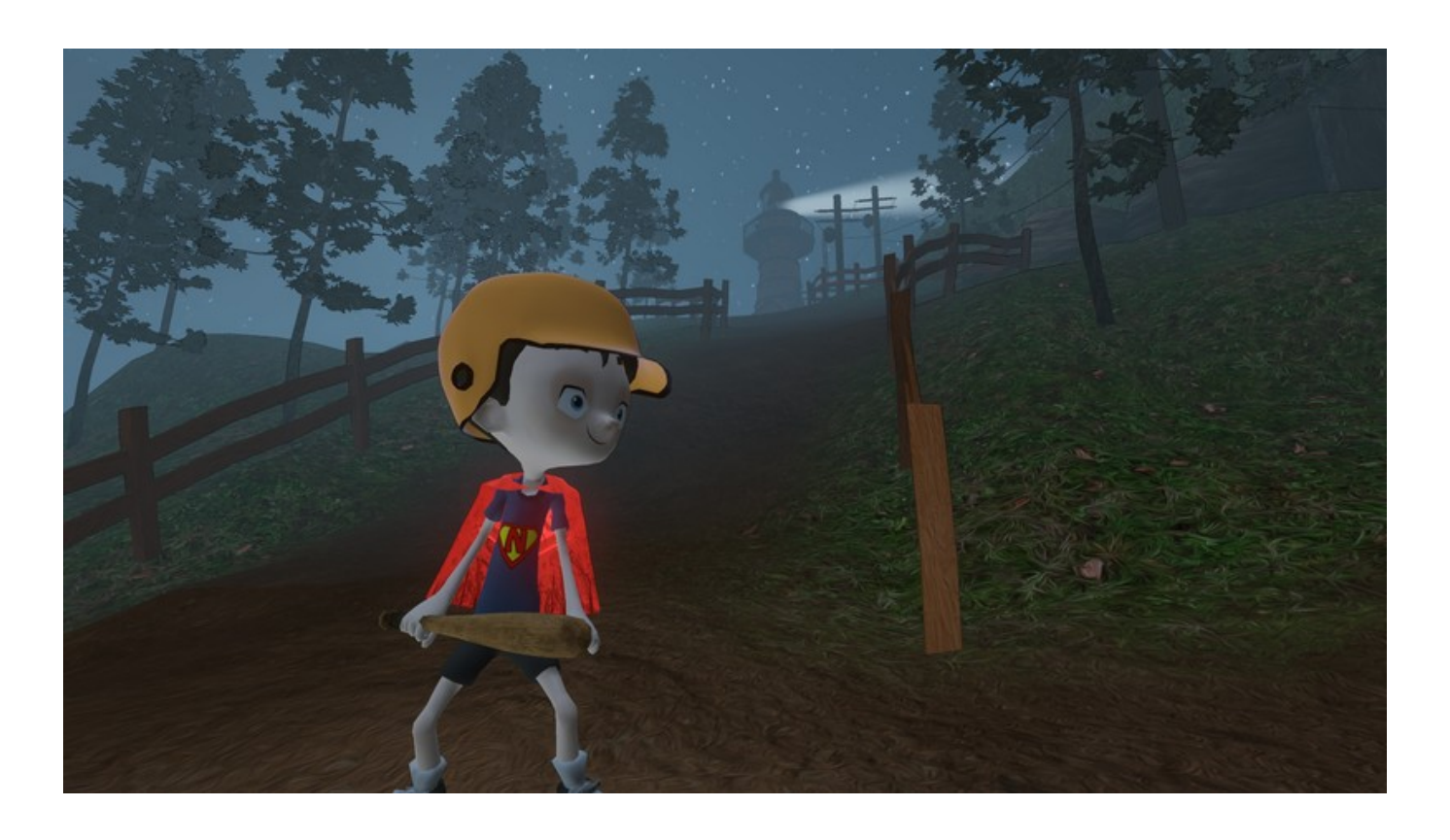
Mervils: A VR Adventure Download For Pc [addons]

Download ->>> <a href="http://bit.ly/2JXAJoe">http://bit.ly/2JXAJoe</a>